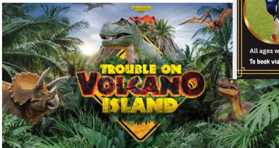
SUN, 4 AUG AT 14:00 TROUBLE ON VOLCANO ISLAND - Carnegie Theatre &